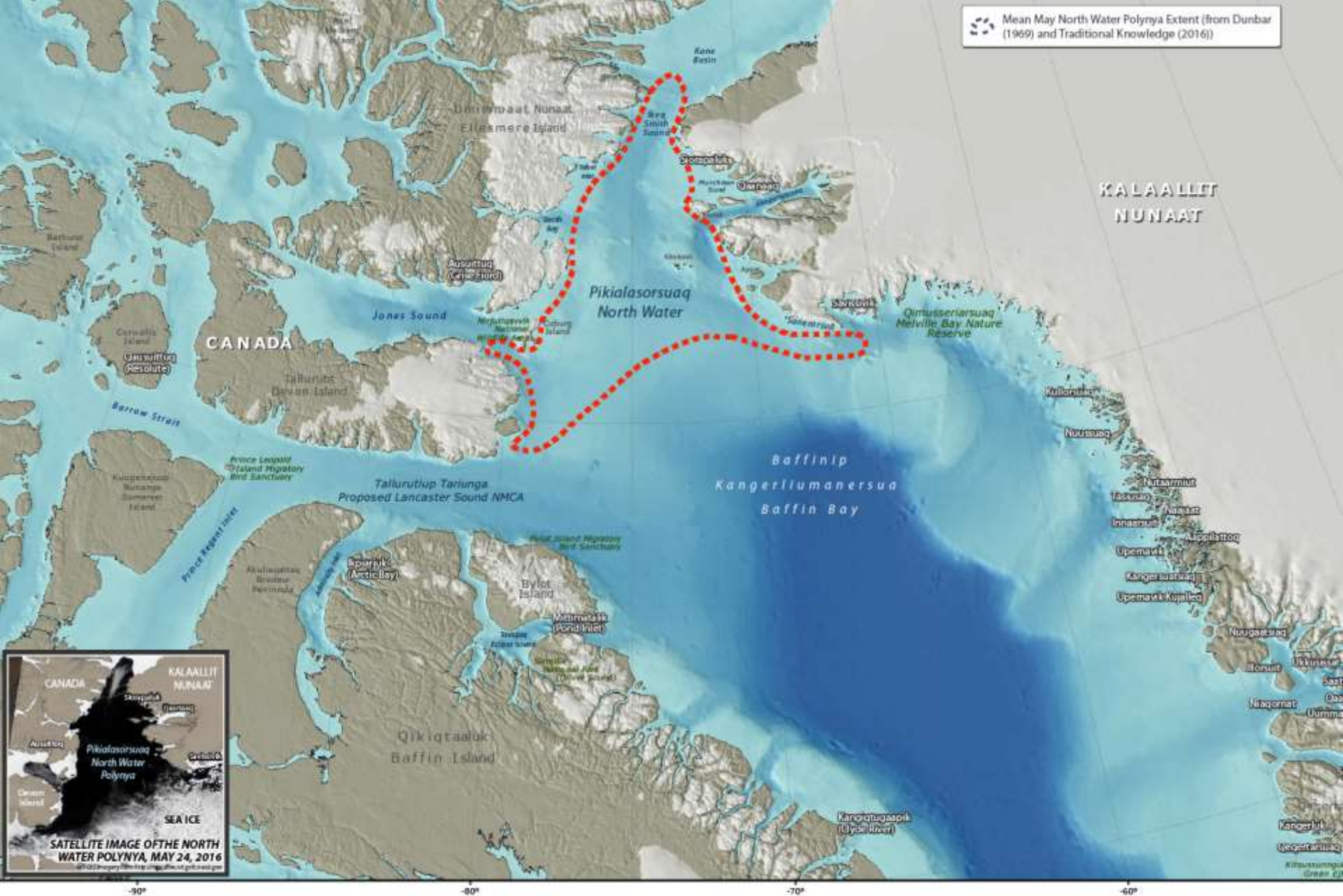
Map of Pikialasorsuaq between Nunavut, Canada and Greenland

Mean May North Water Polynya Extent (from Dunbar (1969) and Traditional Knowledge (2016))