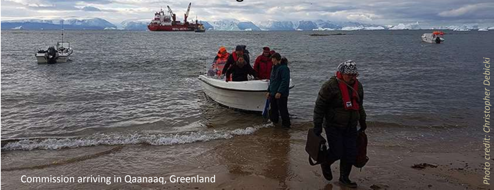
Commission arriving in Qaanaaq, Greenland